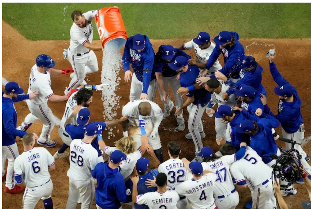
Dramatic walk-off home runs from Corey Seager and Adolis Garcia help the Rangers take Game 1 of the 2023 MLB World Series.